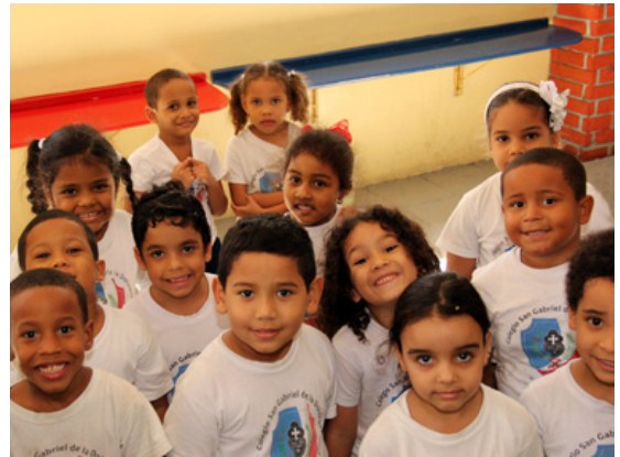
The Councils visited the Kindergarten at St. Gabriel’s “Colegio” [pre-K through high school], which the Passionists operate in Santo Domingo.