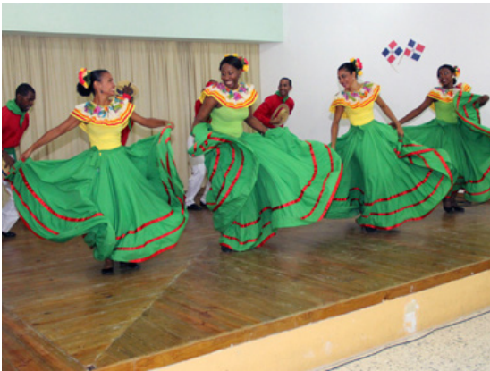
St. Matthias Parish hosted the guests at a “Dominican Folklore, History and Meal” celebration. Traditional dances were featured.