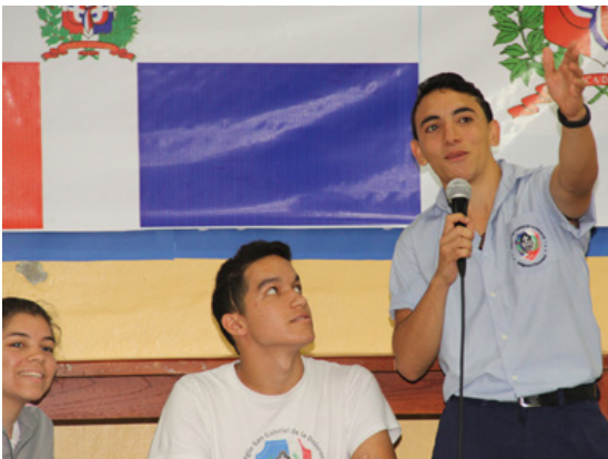
Senior students sat with their faculty and guests for a question and answer session. The students were impressive for their candor, self-confidence and respect for one another.